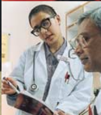
LEFT: © London Picture Service / Foreign & Commonwealth Office TOP RIGHT: © Foreign & Commonwealth Office BOTTOM RIGHT: © Foreign & Commonwealth Office