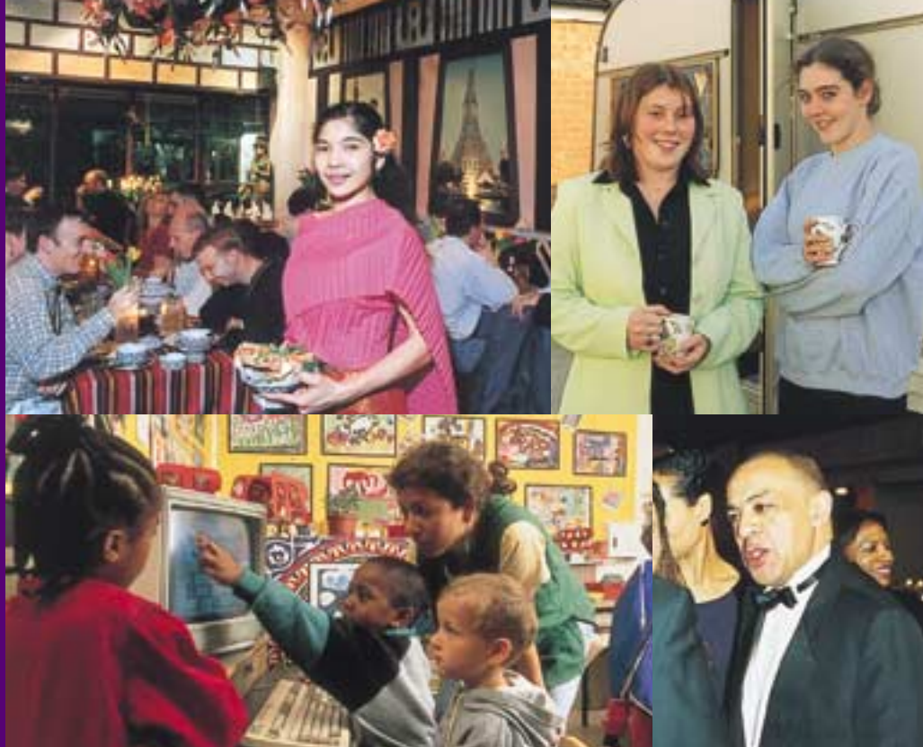
THIS PAGE TOP LEFT: © London Picture Service / Foreign & Commonwealth Office TOP RIGHT: © Foreign & Commonwealth Office BOTTOM LEFT: © Foreign & Commonwealth Office BOTTOM RIGHT: © Foreign & Commonwealth Office